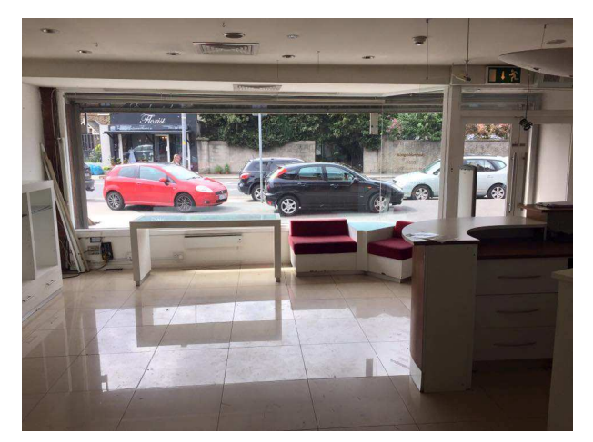
Unit prior to commencement