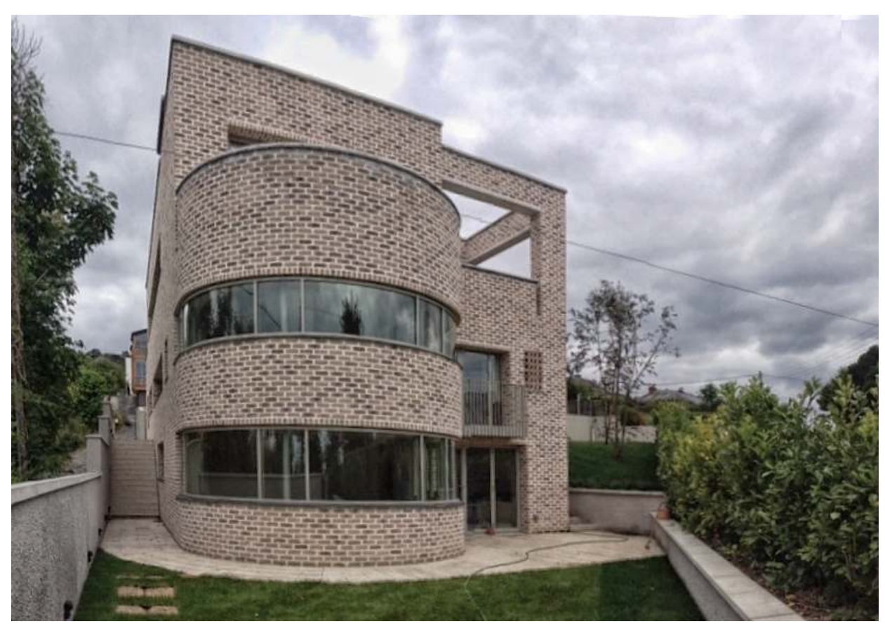
Front façade, with bespoke curved glazing