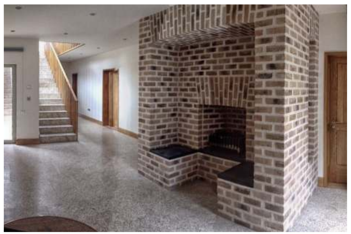
Solid fuel brick fireplace in entrance lobby, with Slivester buff polished granite floor