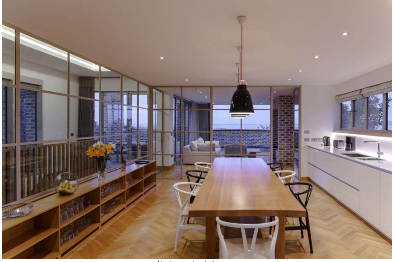
Kitchen / Dining Area