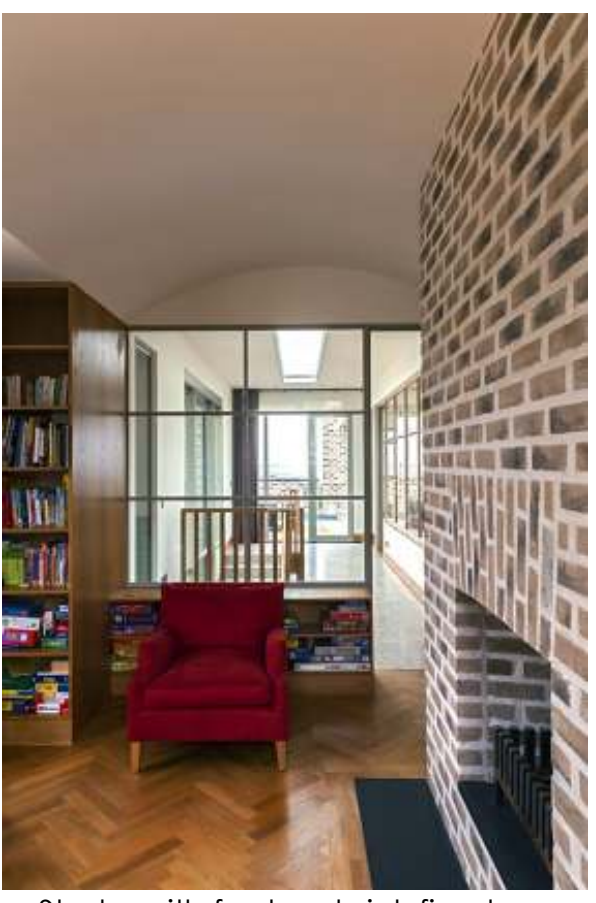
Study, with feature brick fireplace