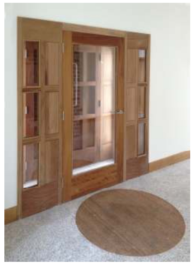
Bespoke Main Entrance oak doors Brass insert trim to entrance matwell