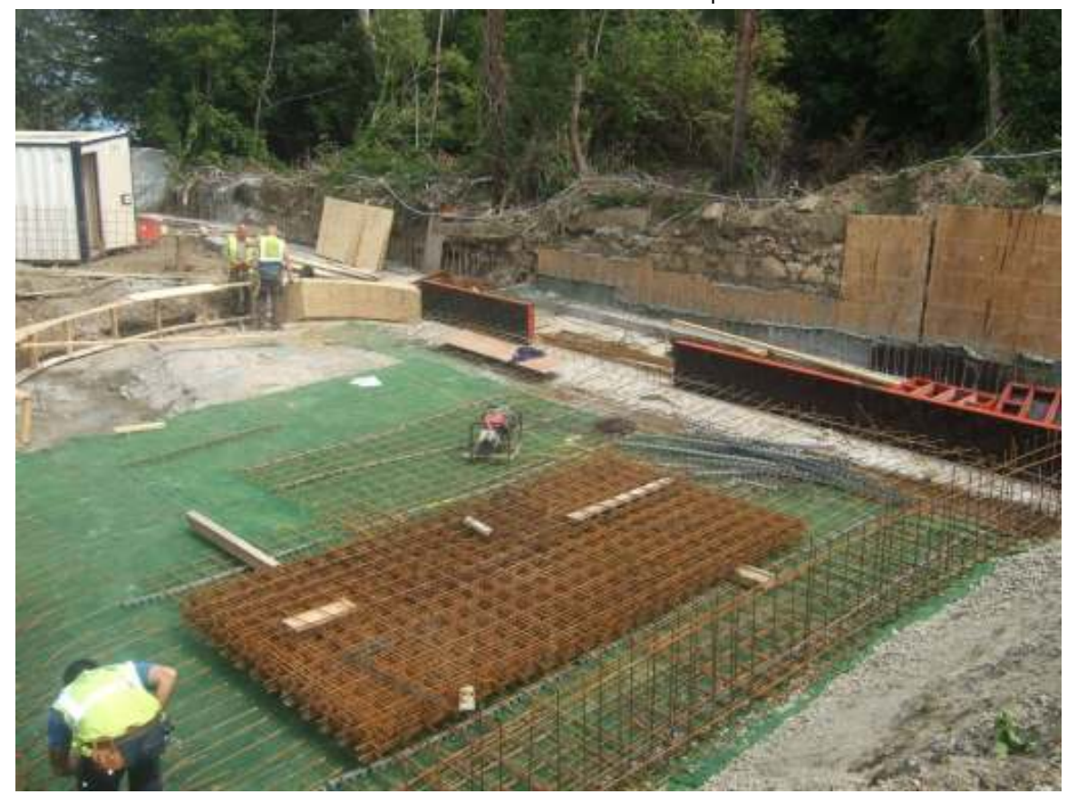
Installation of Concrete Reinforcement