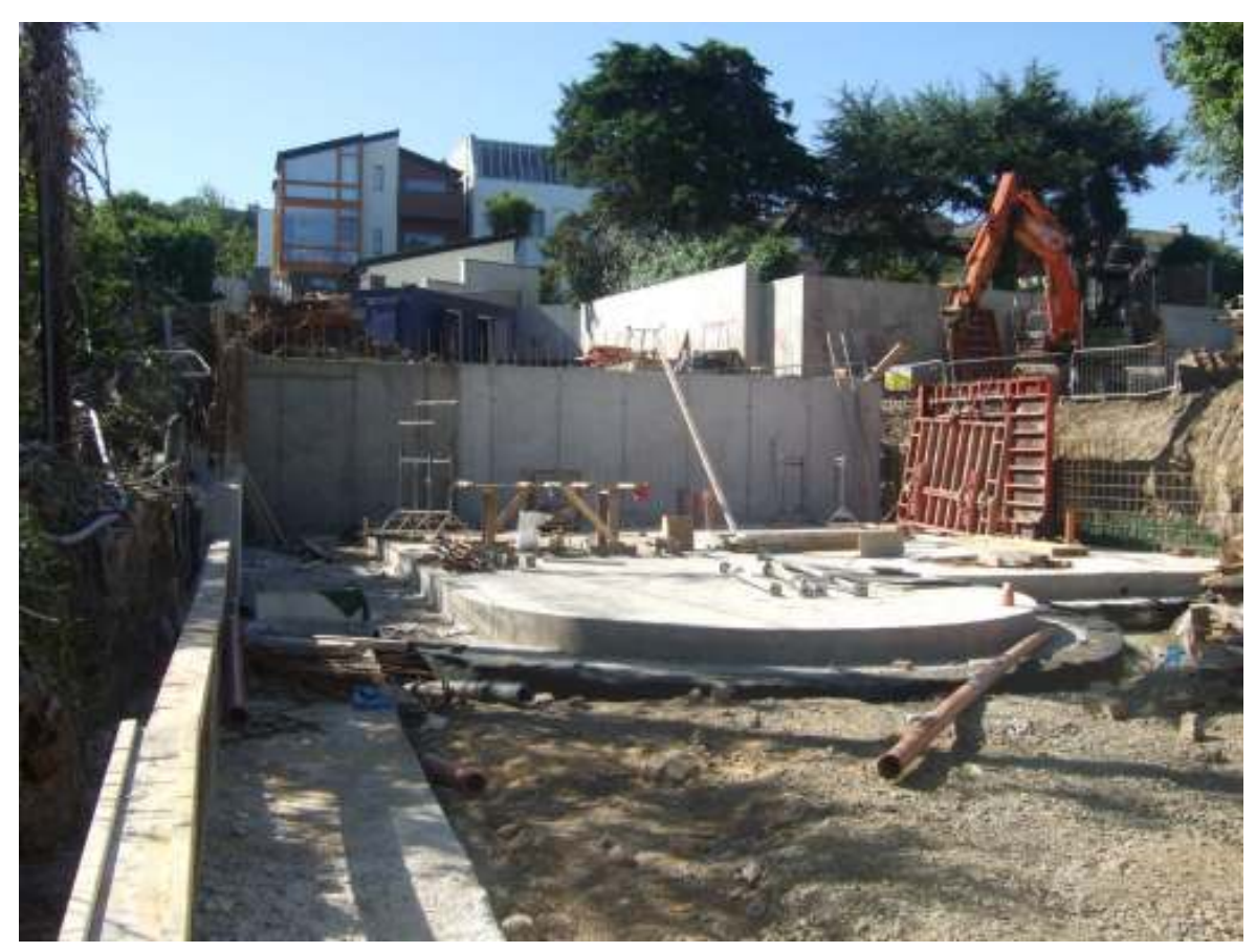
Basement Slab and retaining reinforced concrete wall