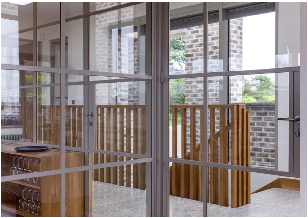
Bespoke internal glazed Crittal partitions