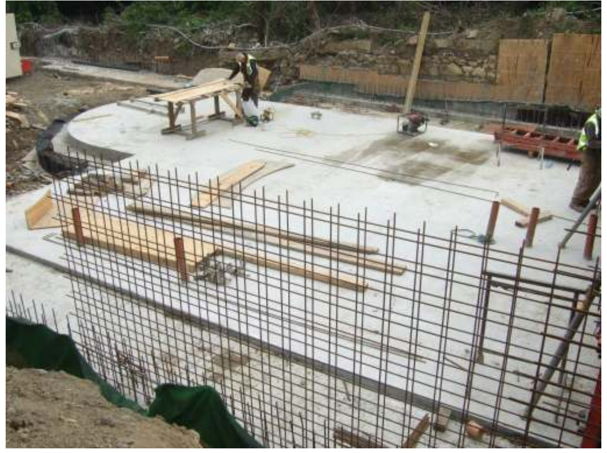
Installation of Concrete Reinforcing