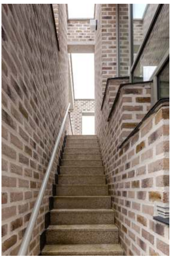
External Staircase, with natural slate cills