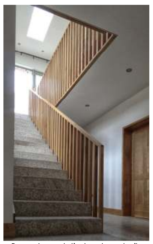
Bespoke oak timber handrail