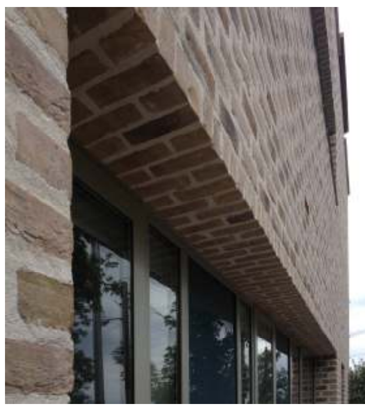
Side elevation, featuring 8 meter long window, 25mm joints with lime mortar, 35mm peps, natural slate cills and a brick-and-a-half hanging detail