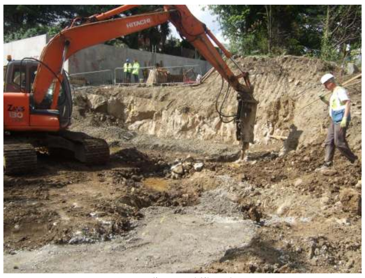
Excavations and Site set up