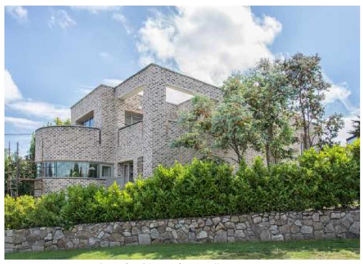
View of residence from Dalkey Avenue