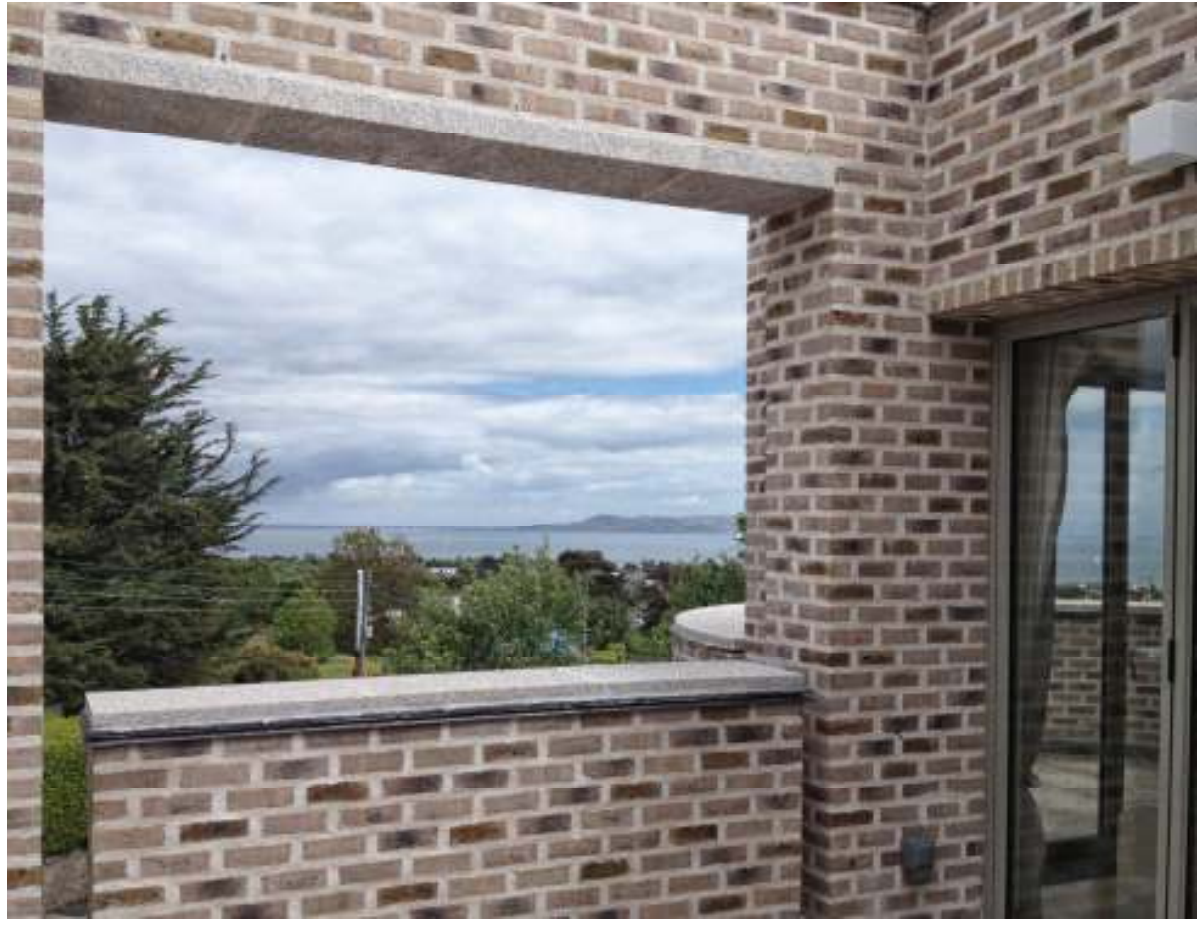
2<sup>nd</sup> floor balcony, with suspended granite capping. Slate and lead roll drip under granite capping